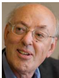
Henry Mintzberg Co-founder IMP M at McGill University